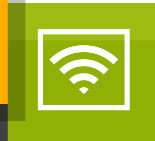
2.4 GHz Wifi & AP