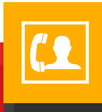
8 SIP Account